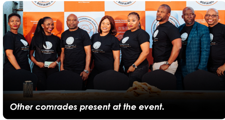
Other comrades present at the event.