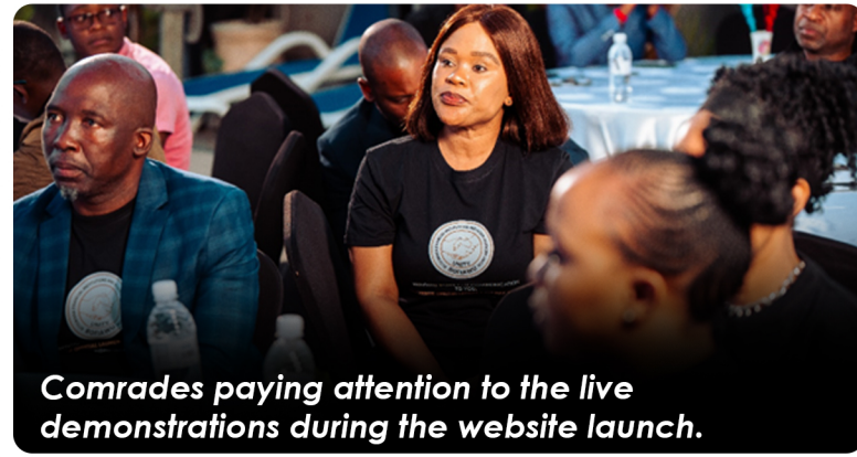
Comrades paying attention to the live demonstrations during the website launch.