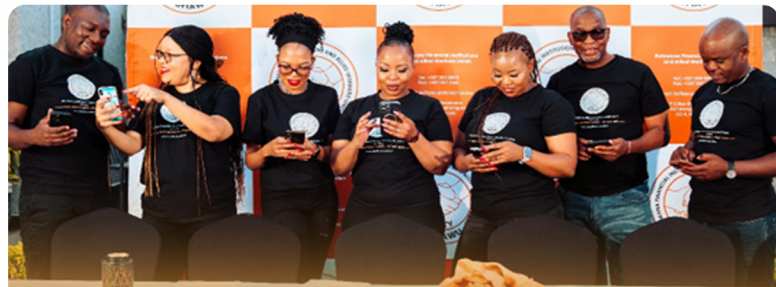
BOFIAWU NEC and Staff logging into the new website for the first time.